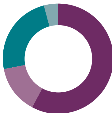
Investment mix at 31.12.2024