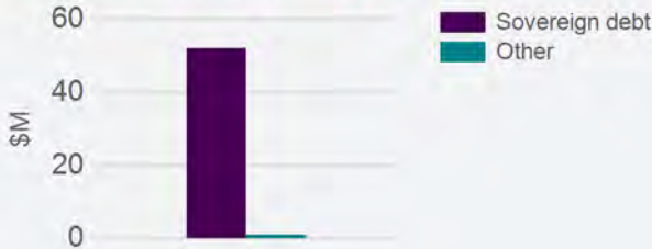
Fund asset breakdown by holding value 2024

*We apply our Royal London Asset Management's classification for company sectors