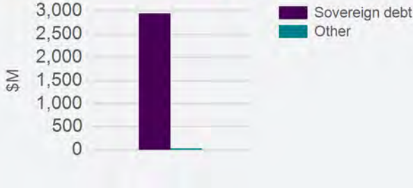
Fund asset breakdown by holding value 2024

*We apply our Royal London Asset Management's classification for company sectors