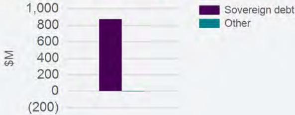
Fund asset breakdown by holding value 2024

*We apply our Royal London Asset Management's classification for company sectors