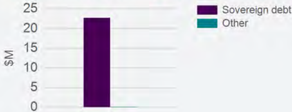
Fund asset breakdown by holding value 2024

*We apply our Royal London Asset Management's classification for company sectors