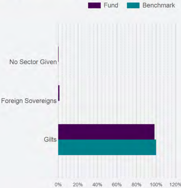
Sector breakdown by holding value 2024

*We apply our Royal London Asset Management's classification for company sectors