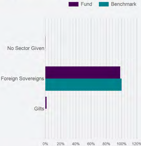
Sector breakdown by holding value 2024

*We apply our Royal London Asset Management's classification for company sectors