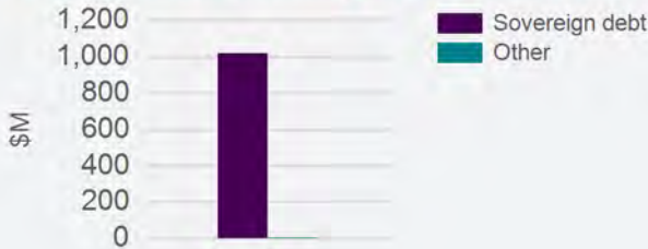
Fund asset breakdown by holding value 2024

*We apply our Royal London Asset Management's classification for company sectors