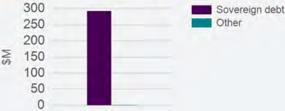
Fund asset breakdown by holding value 2024