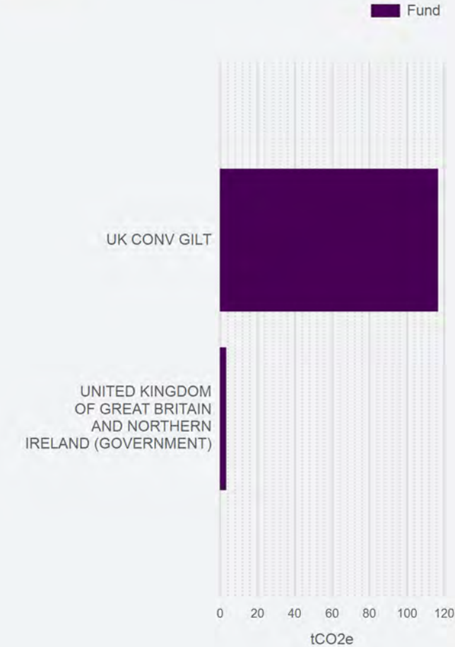
Top contributors to sovereign debt production intensity

The charts above represent the proportional values that make up the total fund metric. Reference to any security is for information purposes only and should not be considered a recommendation to buy or sell. Portfolio holdings are subject to change without a notice.