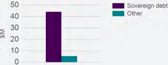
Fund asset breakdown by holding value 2024

*We apply our Royal London Asset Management's classification for company sectors