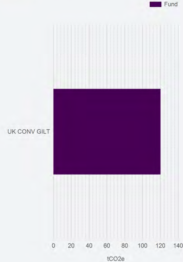
Top contributor to sovereign debt production intensity

The charts above represent the proportional values that make up the total fund metric. Reference to any security is for information purposes only and should not be considered a recommendation to buy or sell. Portfolio holdings are subject to change without a notice.