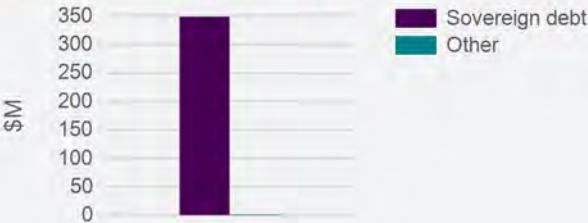
Fund asset breakdown by holding value 2024

*We apply our Royal London Asset Management's classification for company sectors