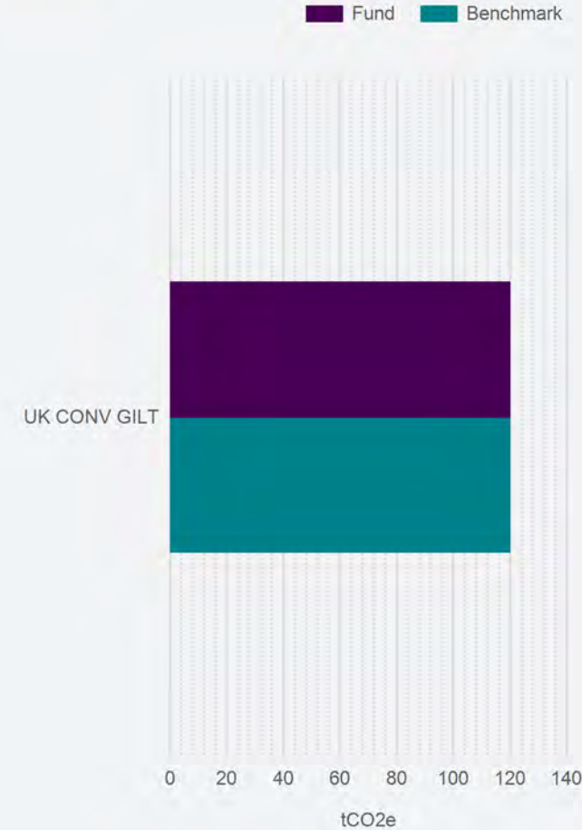
Top contributor to sovereign debt production intensity

The charts above represent the proportional values that make up the total fund metric. Reference to any security is for information purposes only and should not be considered a recommendation to buy or sell. Portfolio holdings are subject to change without a notice.